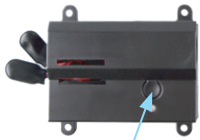
Power Down Box button